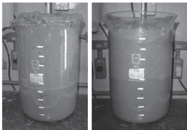
Fig. 1 Froth level of tests with the raw concentrate, froth layer height >5 cm