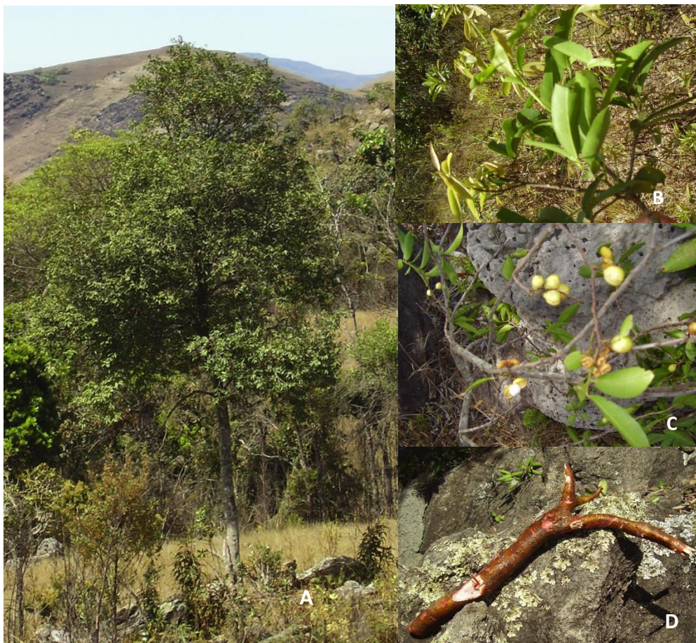
Figure 1. Photos of M. salicifolia Reissek, that is commonly found in Serra de Ouro Branco, MG, Brazil. A: Tree, B: leaves, C: seeds and D: part of the root

M. robusta 24 and other species of the Celastraceae family of natural occurrence in Minas Gerais, Brazil.